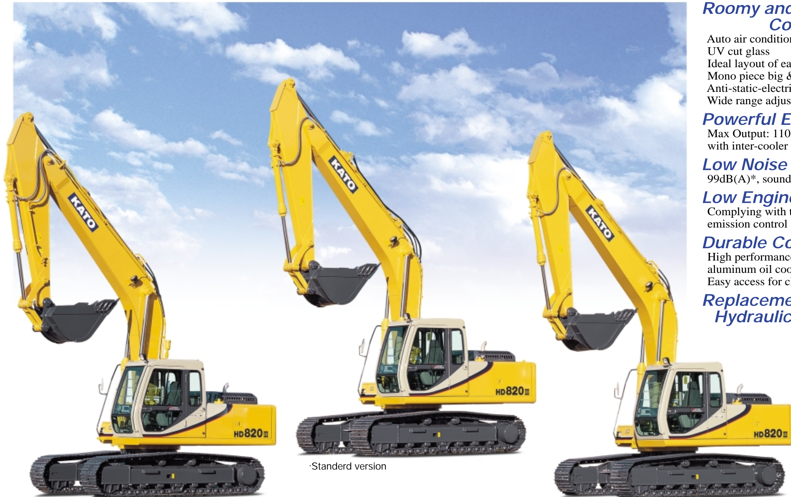
·Type K-version for demorishon work